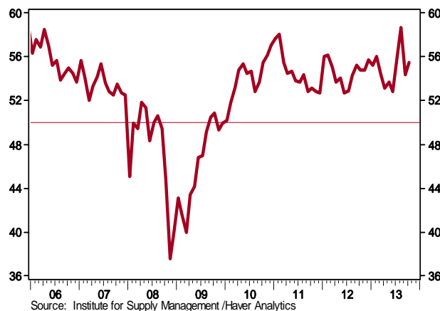
ISM: Nonmfg: Prices Index