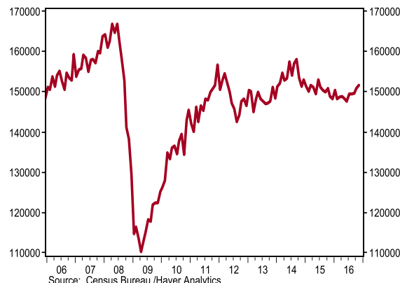
Mfrs' Shipments: Nondefense Capital Goods ex Aircraft SA, Mil.$