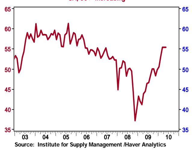
ISM: Nonmfg: Prices Index SA, 50+ = Econ Expand