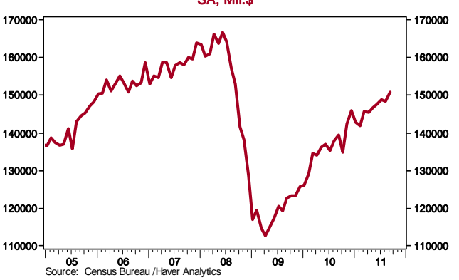
Mfrs' Shipments: Nondefense Capital Goods ex Aircraft SA, Mil.$