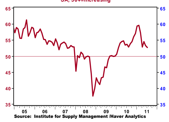
ISM: Nonmfg: Prices Index SA, 50+ = Econ Expand