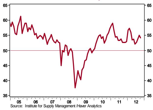
ISM: Nonmfg: Prices Index SA, 50+ = Econ Expand