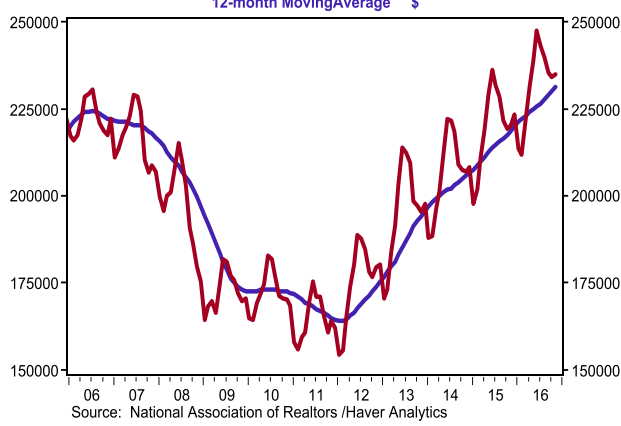
Existing Homes: Median Sales Price

temporarily price some lower-end buyers out of the market, it should ultimately help alleviate some of the supply constraints as "on the fence" sellers take advantage of higher prices and trade-up or trade-down to a new home. Although some analysts may be concerned about the impact of higher mortgage rates, it's important to recognize that rates are still low by historical standards, incomes are growing, and the homeownership rate is eventually going to move higher again.