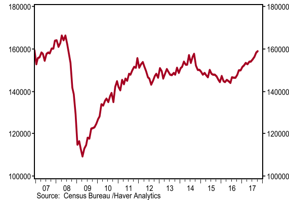
Mfrs' Shipments: Nondefense Capital Goods ex Aircraft SA, Mil.$