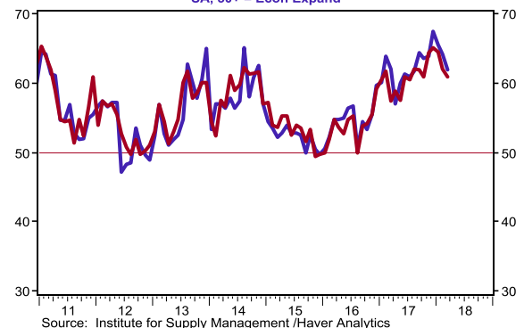
ISM Mfg: New Orders Index SA, 50+ = Econ Expand