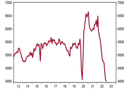
NAR Total Existing Home Sales, United States SAAR, Thous