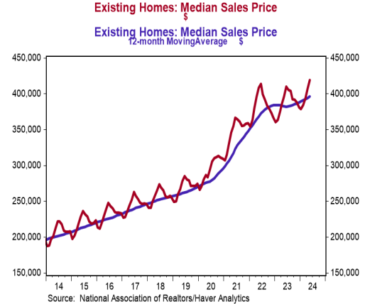
long it would take to sell existing inventory at the current very slow sales pace) was 3.7 in May, well below the benchmark of 5.0 that the National Association of Realtors uses to denote a normal market. A tight inventory of existing homes means that while the pace of sales looks like 2008, we aren't seeing that translate to a big decline in prices.