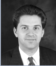
Senior Vice President, Closed-End Fund Analyst