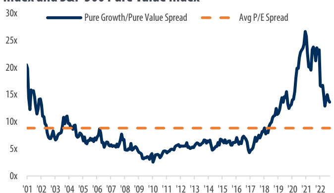
Chart 1: Forward P/E - Spread between S&P 500 Pure Growth Index and S&P 500 Pure Value Index

Monthly data is calculated from 12/29/00 - 9/30/22. Forward Price-to-Earnings (P/E) is calculated by taking the price divided by next twelve months earnings per share. For illustrative purposes only and not indicative of any investment.