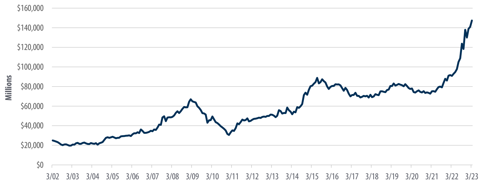
Chart 2: U.S. Construction Spending on Manufacturing (Seasonally-adjusted Annual Rate)

Data as of 3/31/02 - 3/31/23.